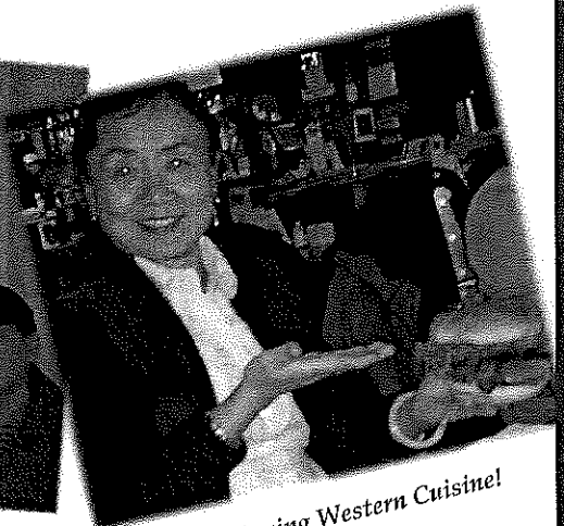
Enjoying Western Cuisine!