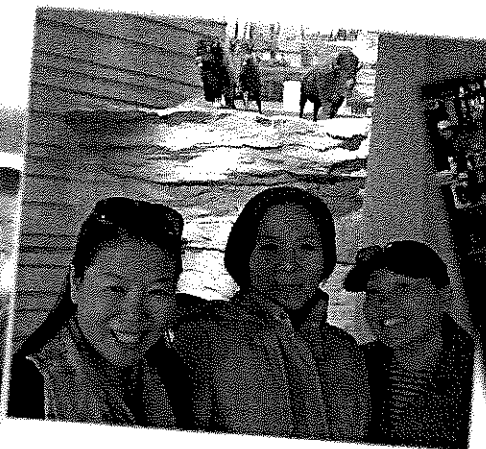
Visit to Head Smashed in Buffalo Jump World Heritage Site and other attractions