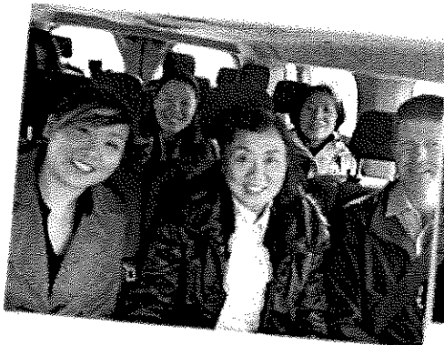
Bus tour of AlbertaSW

The visiting mission to build business-to-business contact between Anyang China and southern Alberta was a great learning opportunity and successfully showcased regional opportunities. Businesses in the region connected with each other, gained new appreciation for what we offer. We all increased our understanding of investment readiness. This partnership between AlbertaSW, SouthGrow and Economic Development Lethbridge also sets the stage for connecting with other markets in Europe and elsewhere.